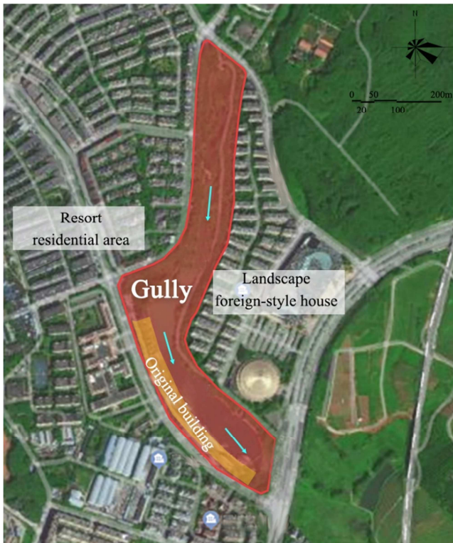
Figure 1. Current location map of gully.

program. The project is near the Dai Show theater and landscape houses in the east, and the high-end residential area in the west. The current water conservancy facilities are relatively simple, and there are no leisure facilities in the site, which has become an “unrepaired patch” in the site. Improving the quality of water conservancy projects and the waterfront environment has become an important part of the construction of the resort. However, the reconstruction involves the demolition of local residents, downstream flooding problems, ecological environment destruction and later maintenance problems. Although the development company is actively promoting the project, some citizens are opposed to it, while others are neutral. Therefore, it is necessary to analyze the inherent problems, feasibility and construction plan of the project from the perspective of engineering ethics in order to maximize the interests of all parties.