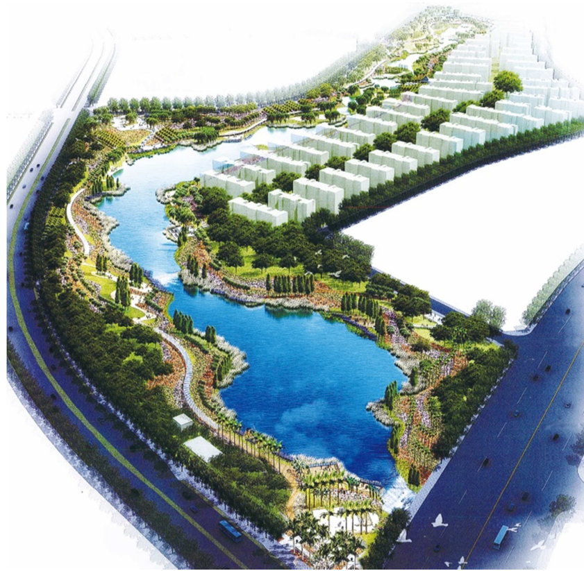
Figure 4. Gully water conservancy engineering rendering.